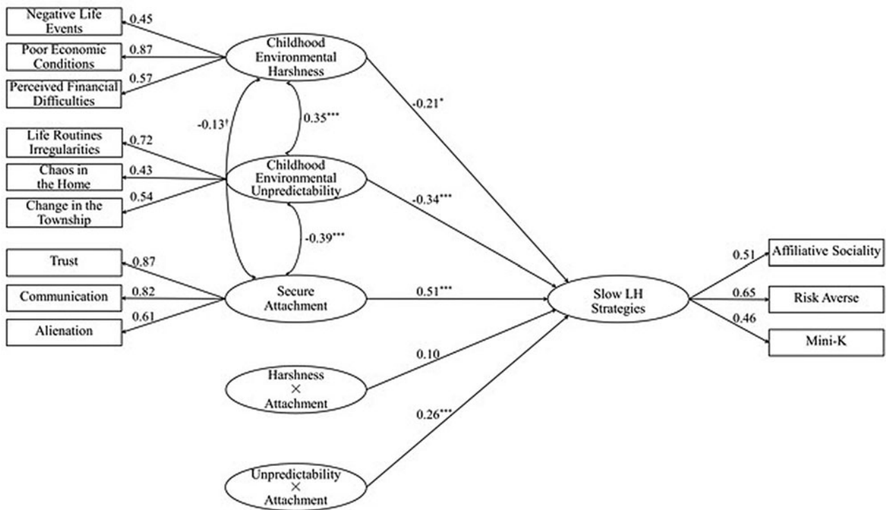
Figure 1. Childhood environmental harshness and unpredictability, secure attachment, and their interaction in relation to slow LH strategies. Note. † p < .10 , * p < .05 , ** p < .01 , *** p < .001 .